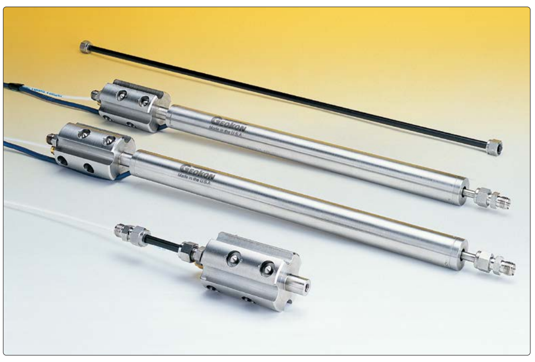
Model A-9 Retrievable Extensometer bottom anchor (front), transducer with anchor (middle two), and connecting rod (rear).