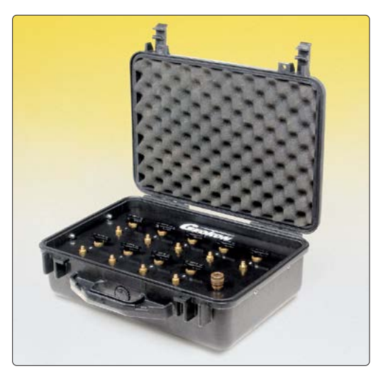
Model 1300-3 Pressure Manifold.