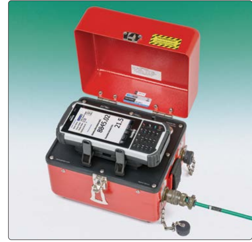
Model GK-405 Vibrating Wire Readout.